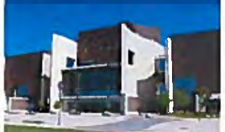
Visit to the National Underground Railroad Freedom Center