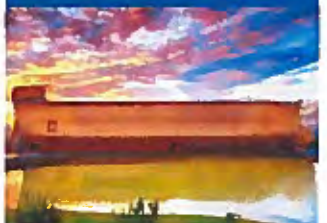
Incredible Ark Encounter

$75 Due Upon Signing. *Price per person, based on double occupancy. Add $165 for single occupancy. Final Payment Due: 3/27/2019