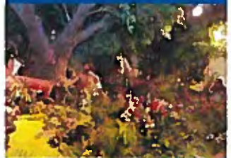
Visit to the Amazing Creation Museum!