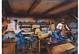
View from Inside the Ark Encounter

Day 5: Today, after enjoying a Continental Breakfast, you depart for home... a perfect time to chat with your friends about all the fun things you've done, the great sights you've seen and where your next group trip will take you!